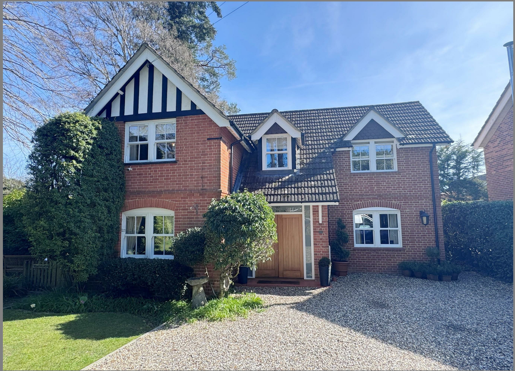
Oak Tree House - Andover Road, Newbury, RG14 6NB